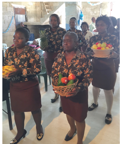
Ladies of Salem Church presenting their "first fruits"