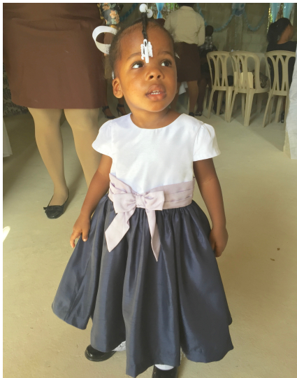
Children came in their “Sunday finest” to Salem Church’s celebration